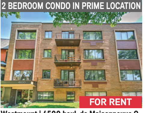
Westmount | 4500 boul. de Maisonneuve O., apt. 41 | $2,750/M