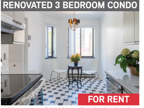
Westmount | 4410 rue Ste-Catherine O, apt. 3C | $2,695/M