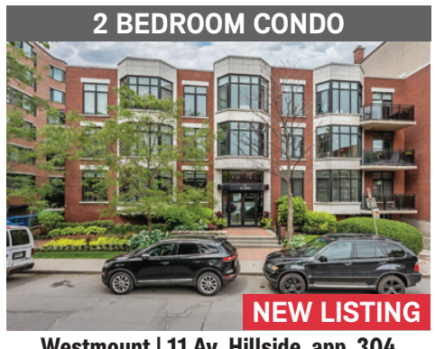
Westmount | 11 Av. Hillside, app. 304 $629.000