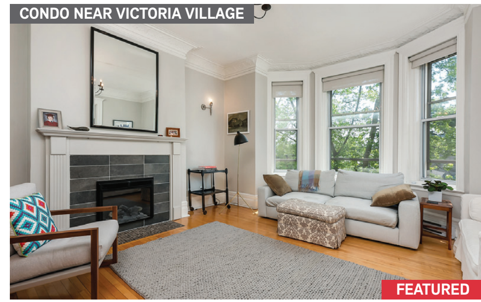
Westmount | 439 Av. Grosvenor, app. 15 | $875,000 or $3,500/M