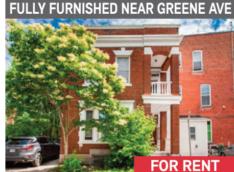
Westmount | 315 Av. Olivier $4.000/M